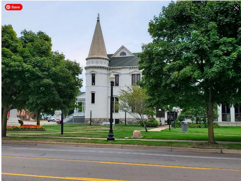
Branch District Library, Coldwater Branch

BRANCH COUNTY, MI (WTVB) – The Branch District Library plans to reopen its doors to the public this Monday, January, 18 as they will move to Stage Five of their COVID-19 Response Plan.