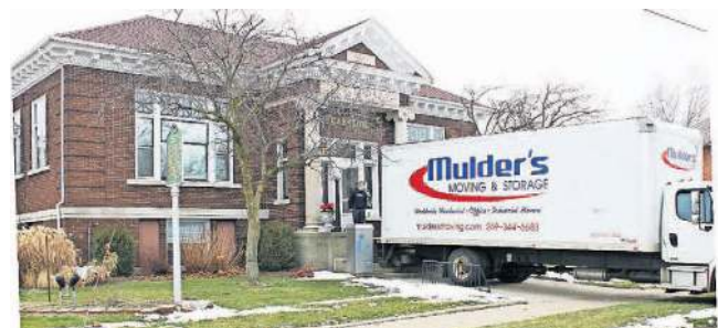
Preparation for construction at the Bronson hub of Branch District Library began Monday, when Mulder's Moving and Storage arrived.

For additional information and to follow the progress, visit the Branch District Library website or the Bronson Library Facebook page.